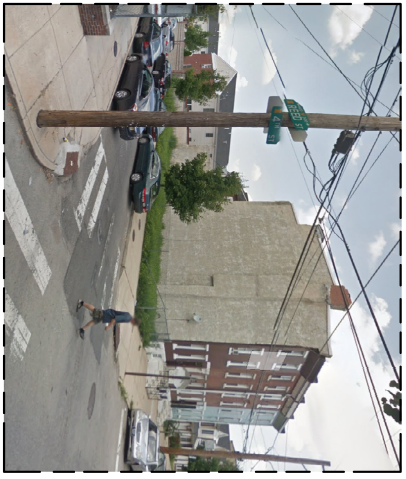
REED STREET SIDE VIEW