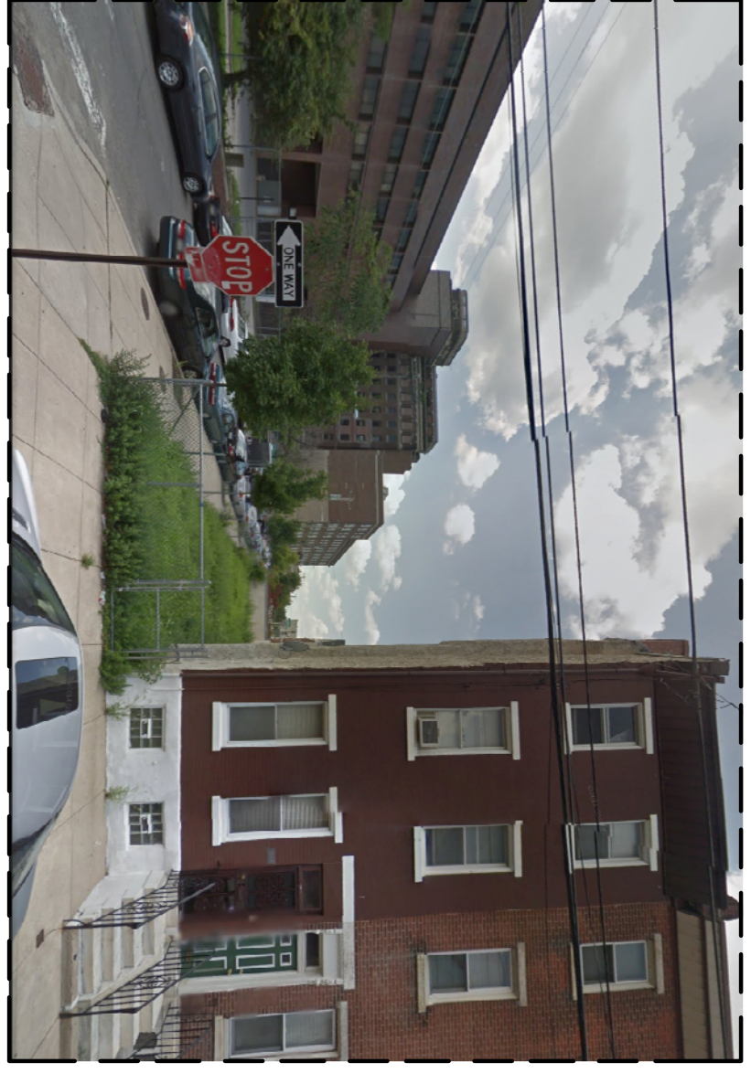
FOURTH STREET FRONT VIEW

REED STREET 50 FEET WIDE (12' - 26' - 12') (LEGALLY OPEN ON CITY PLAN)